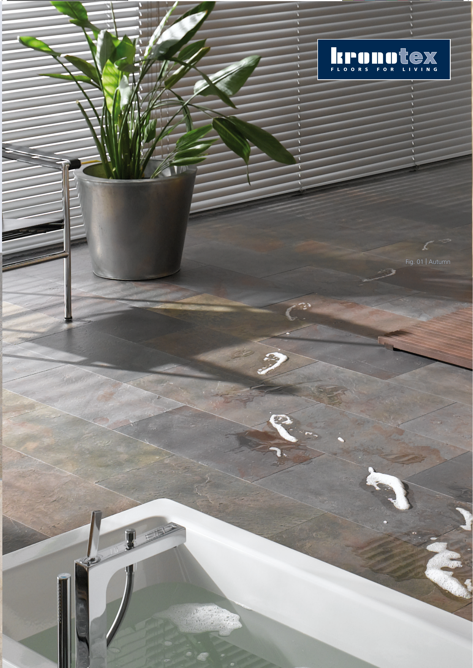
Fig. 01 | Autumn