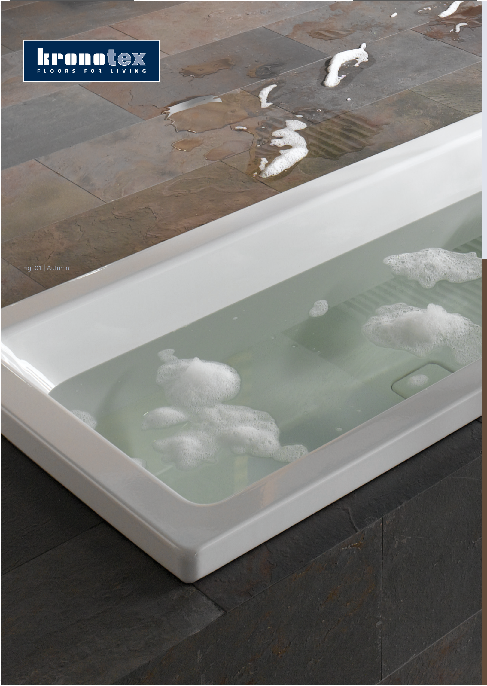
Fig. 01 | Autumn